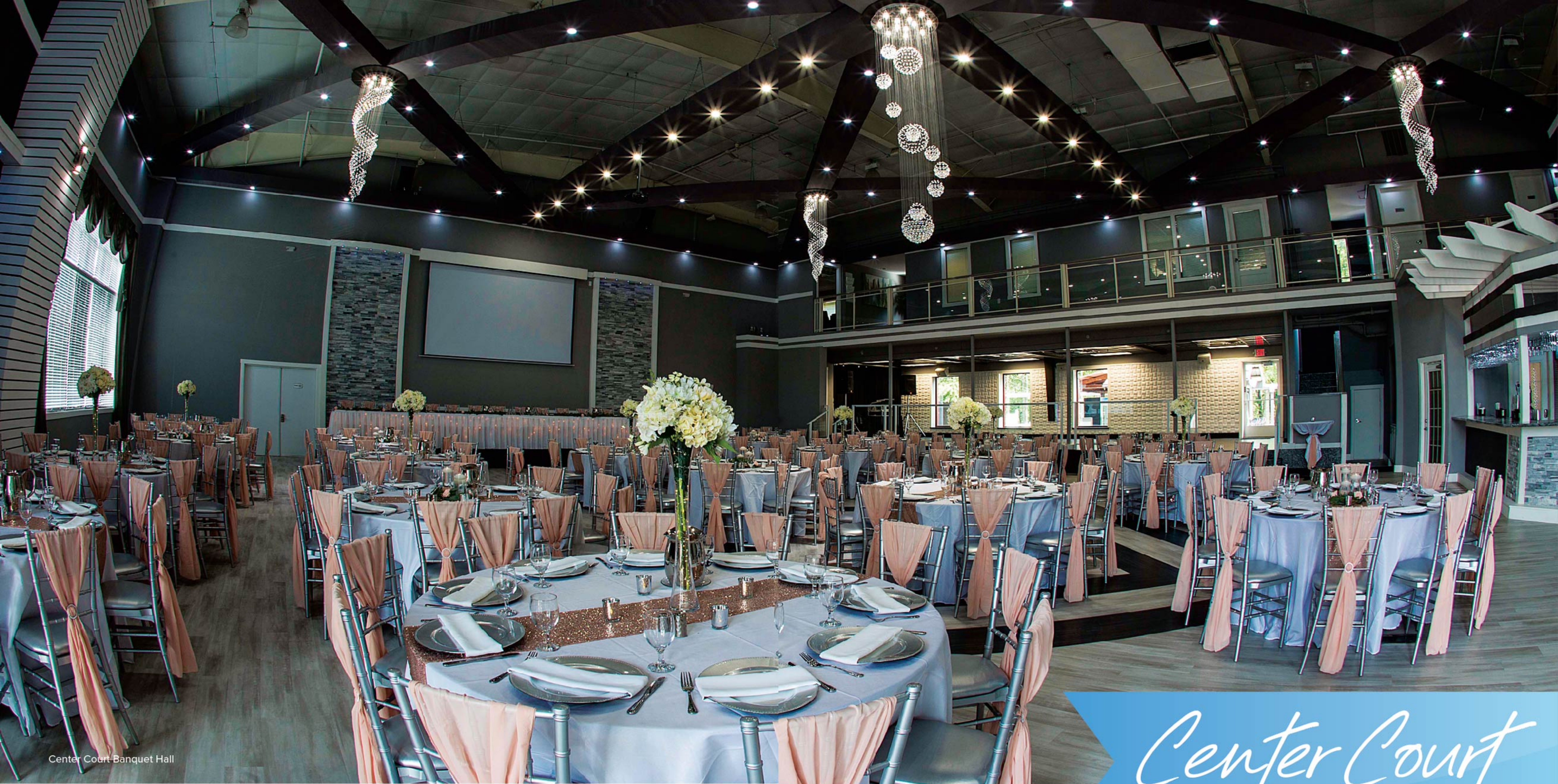
Center Court Banquet Hall