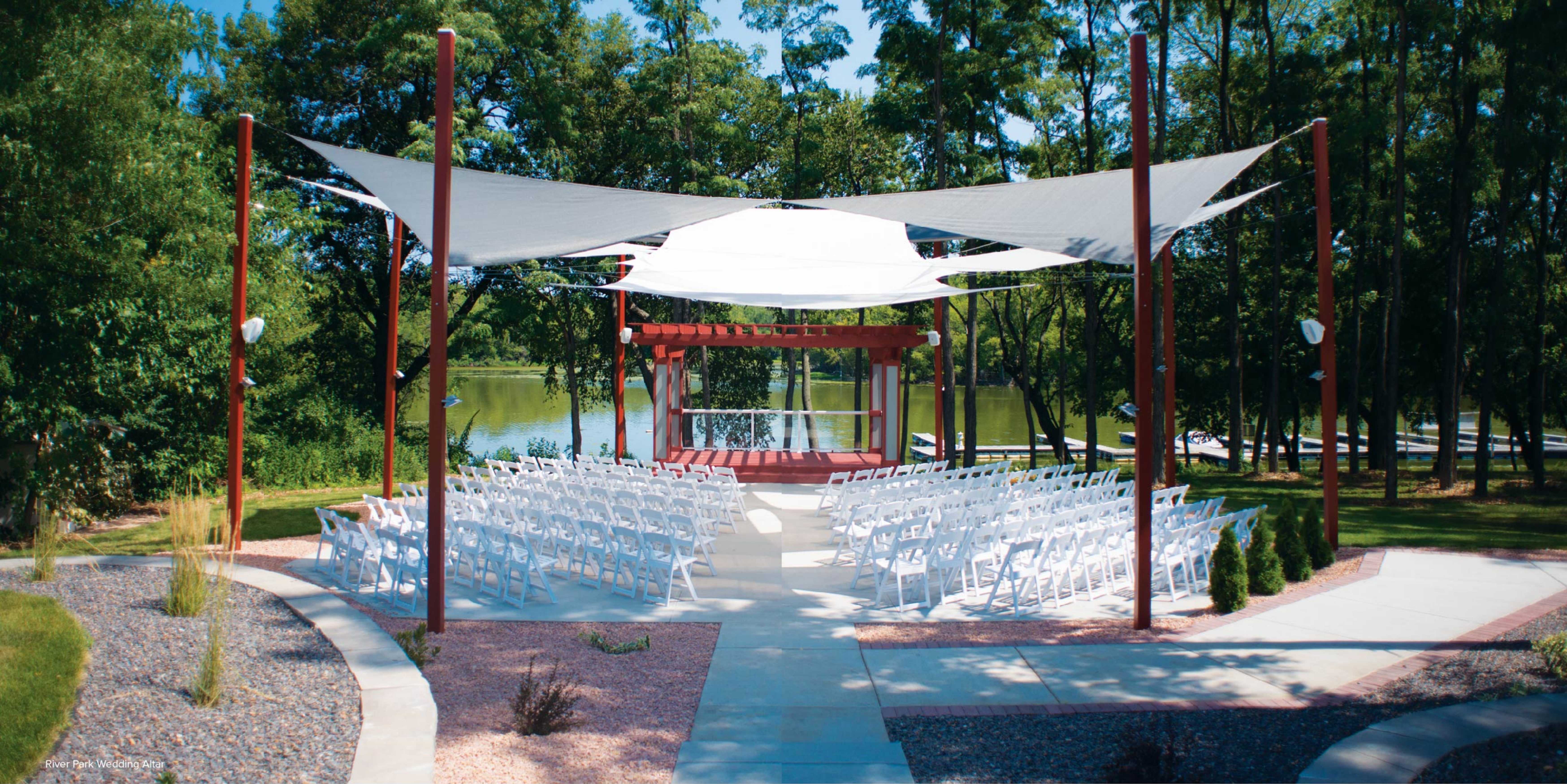
River Park Wedding Altar