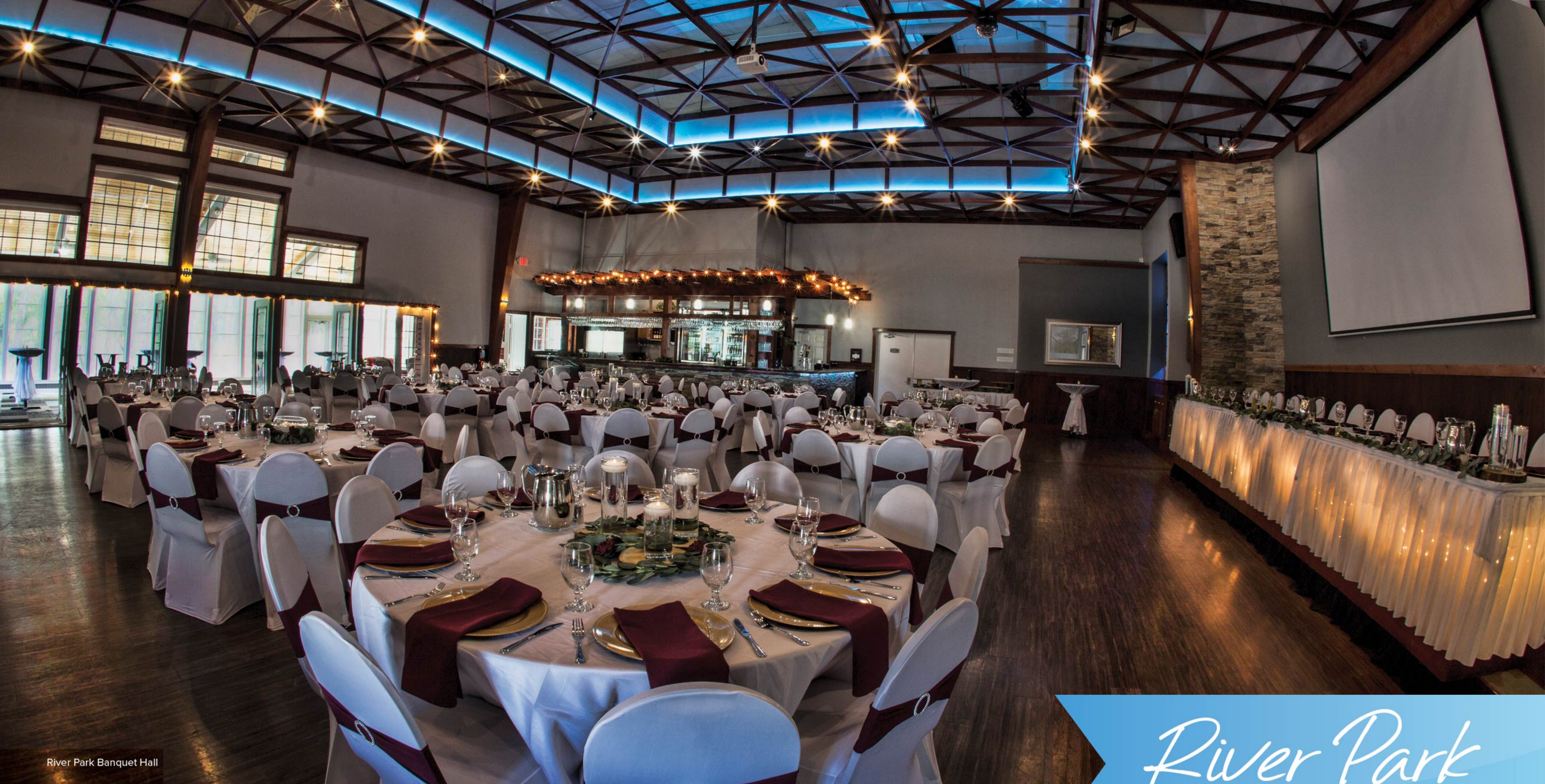
River Park Banquet Hall