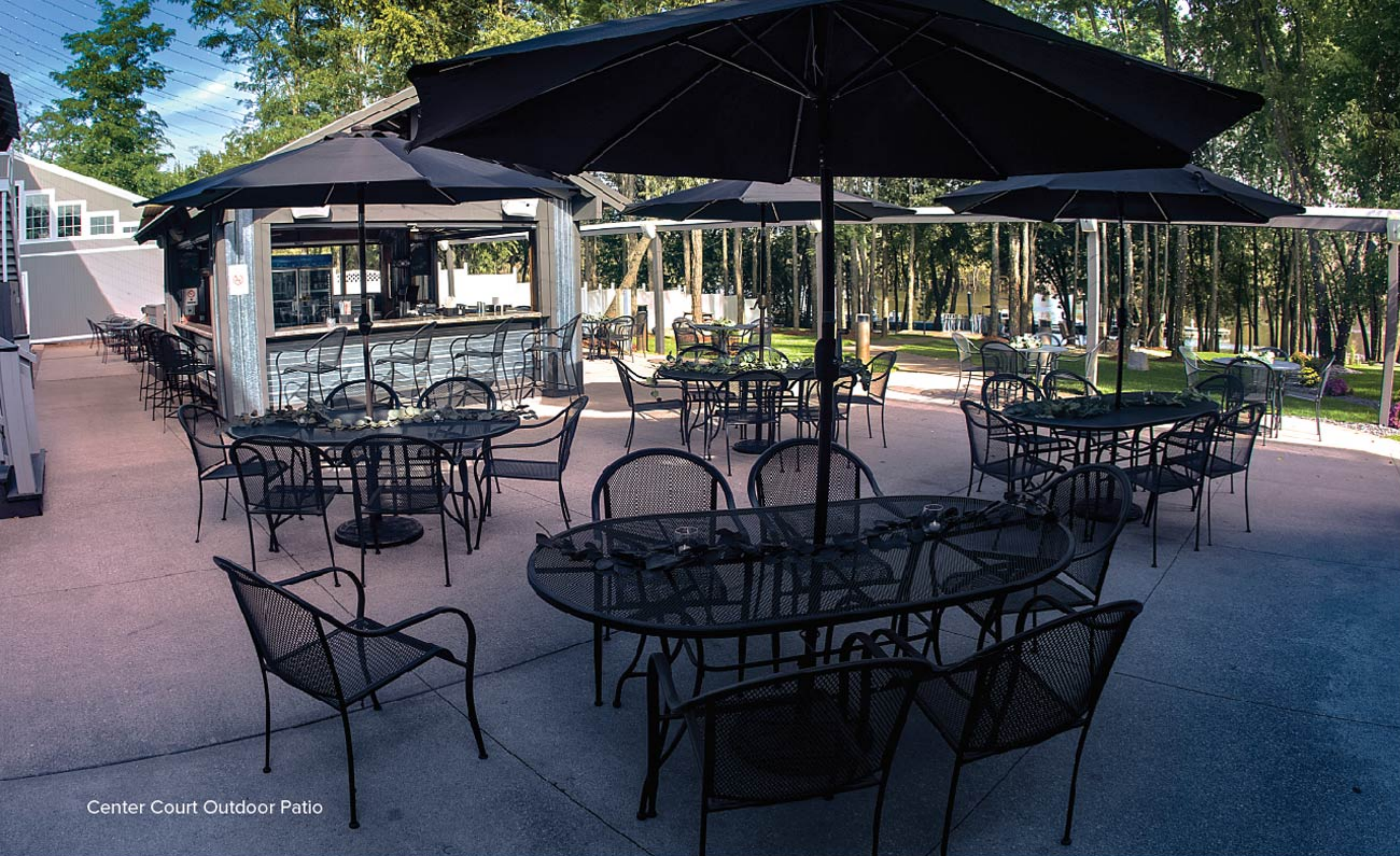
Center Court Outdoor Patio