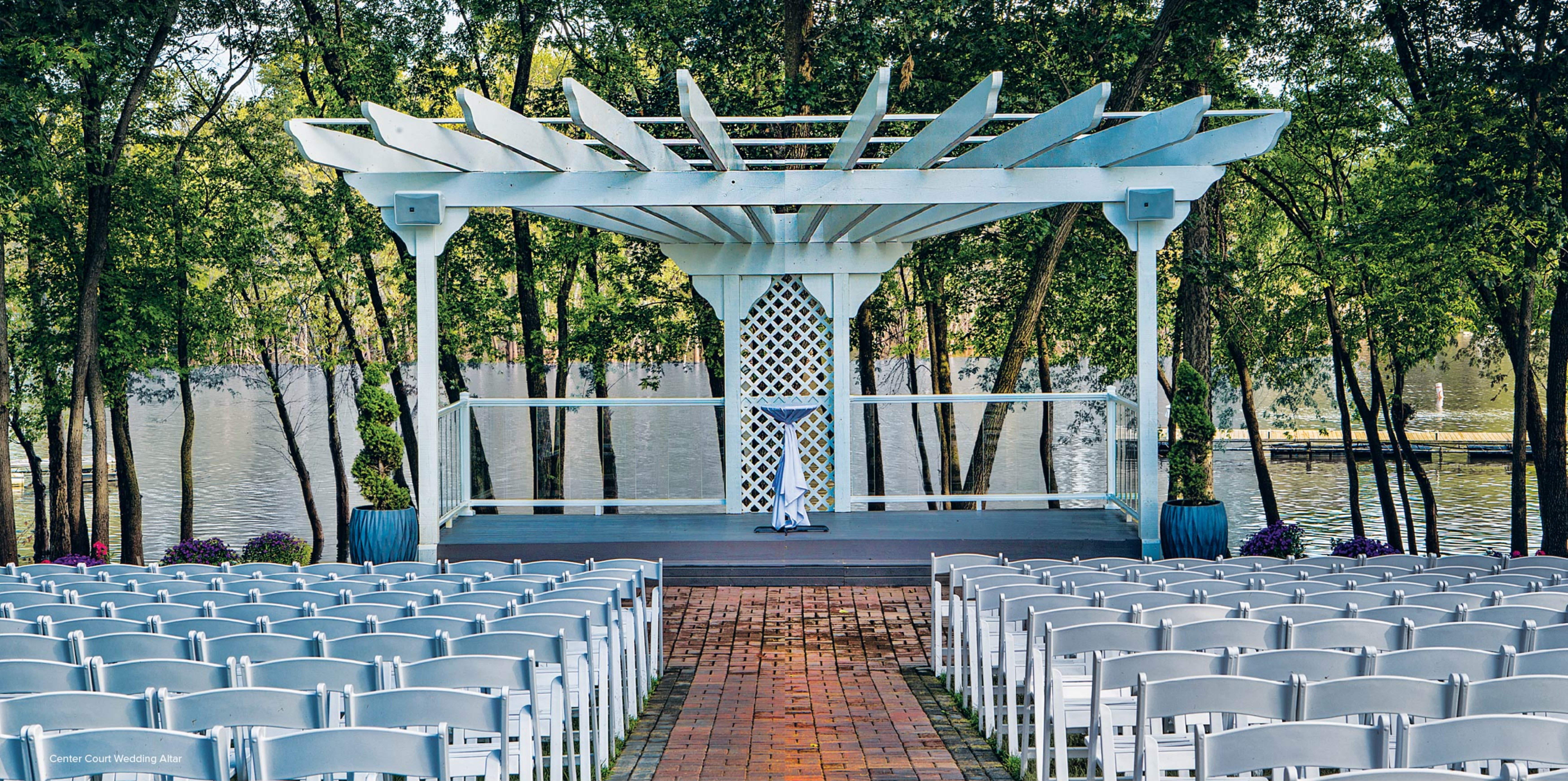
Center Court Wedding Altar