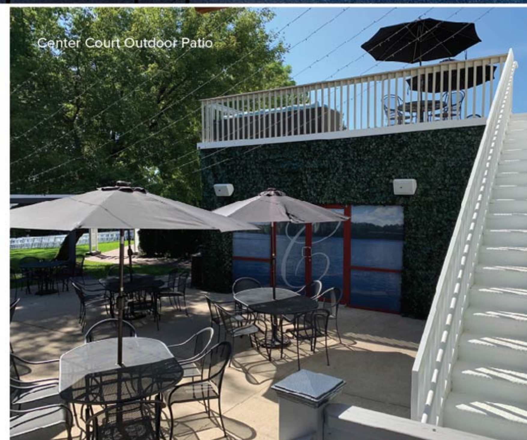
Center Court Outdoor Patio