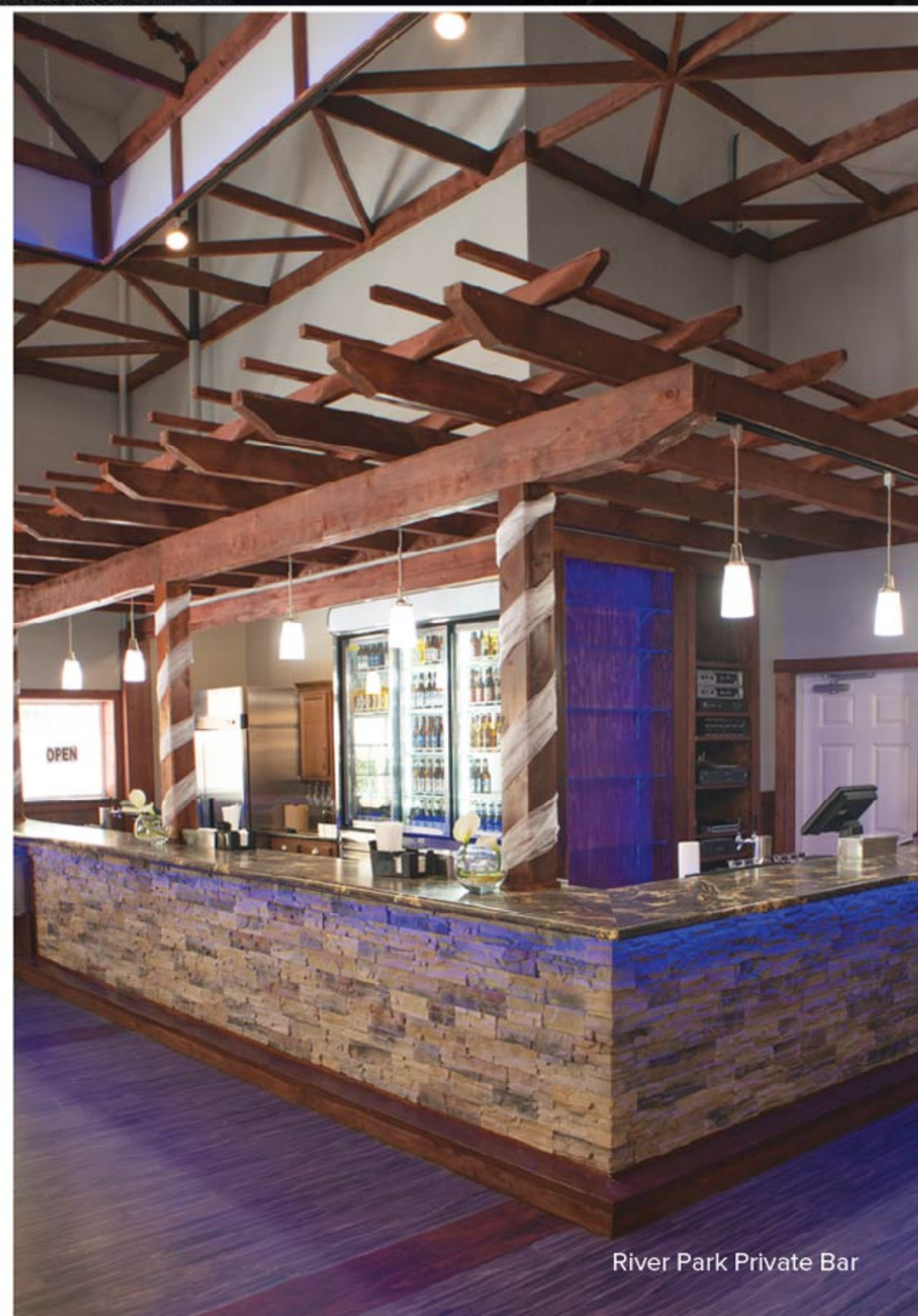
River Park Private Bar