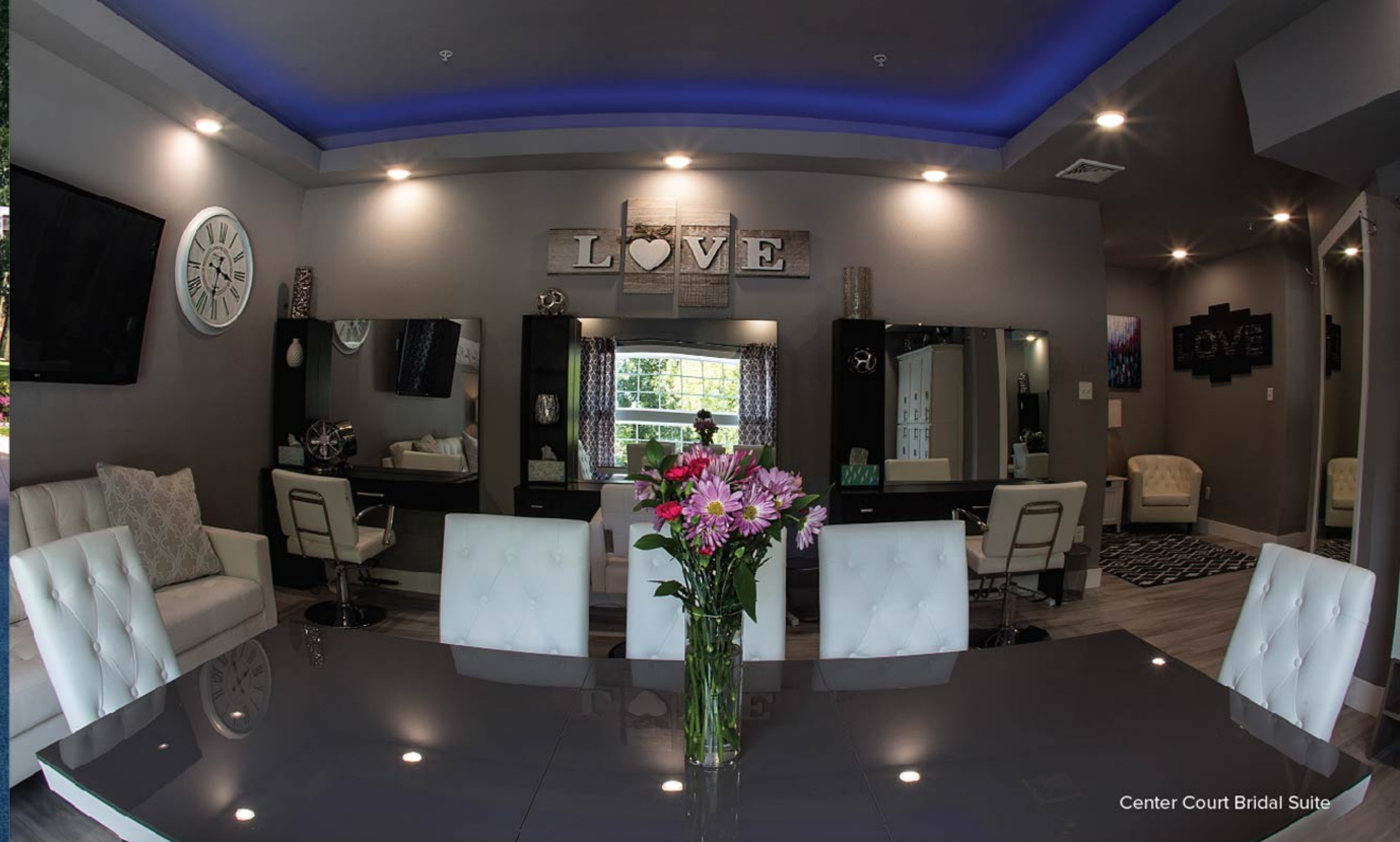
Center Court Bridal Suite